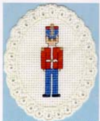
TRADITIONAL TIN SOLDIER