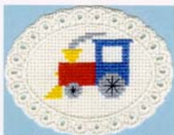
TRADITIONAL TOY TRAIN

Instructions for using Kreinik MarI Silk, and #4 Very Fine Braid and Mill Hill Glass Beads are included inside this chart.